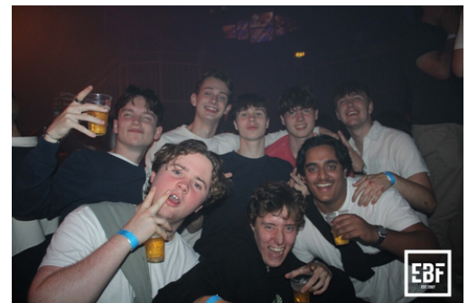
BEGINNING OF THE YEAR PARTY

On 9 September, we celebrated our Constitution Drink, where we were officially congratulated on becoming the 19th Board. Just two days later, on 11 September, the Sport Committee hosted a fun bowling activity, which of course ended with drinks.