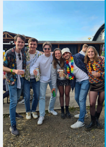
MC ED&G 22-23 @EBFestival

During my five years at the University of Groningen, I completed a Bachelor's degree in International Business, followed by a Master's in Economic Development & Globalisation (now called International Economics and Sustainable Development). During my master's, I was actively involved in the ED&G master community within EBF, where I enjoyed organising activities such as a study trip to Brussels , a visit to The Hague, pub quizzes, social drinks, and an alumni event. I also frequently participated in EBF-wide activities such as the active members' weekend, the EBF Festival , and various career events.