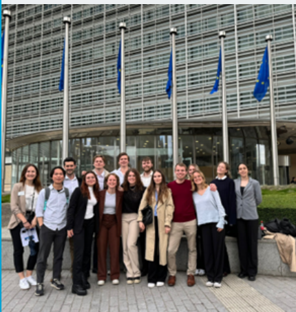
MC ED&G Studytrip to Brussel 23-24

These experiences made my student life not only more enjoyable but also more meaningful : you build a network, develop skills, and it gives you just that little extra during job applications. But most importantly: I had a great time and made lasting friendships.