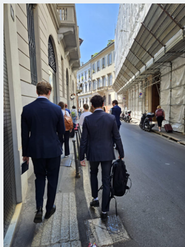
Traineeship to Rome with DNB

My first placement was in a supervision department, where I was involved in assessing board members of financial institutions. After graduating, I wasn't exactly sure what I wanted to do, but I was drawn to working at a public organisation where societal relevance and economic challenges come together. DNB turned out to be the perfect fit.